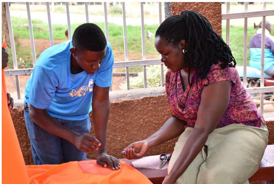
Figure 2A volunteer teaching a community how to make pads

The Figure below shows statistics of par training workshop