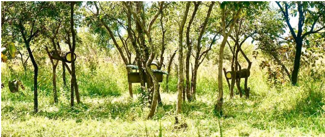
Figure 5 An apiray in Gulu

Innitiated in 2019, the Hive project is designed to identify and support and equip local bee keepers with better equipment, supplies and trainings.