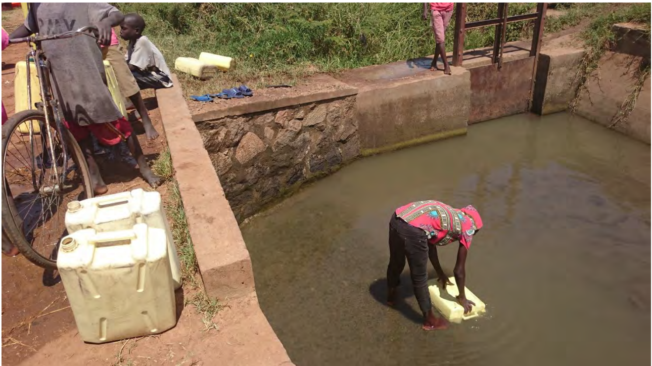
Figure 6 Former water source in Nampologoma

In Butalejja we managed to drill a bore hole and completed to provide clean water to over 1000 households in Nampologoma. In this areas majority of the people could get water from the nearby swamps, a distance of averagely 2km for the households.