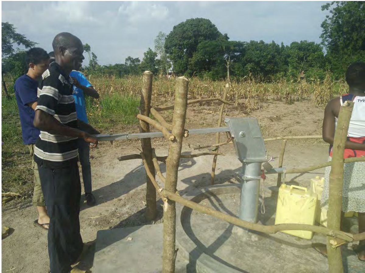
Figure 7 A completed borehole in Nampologoma